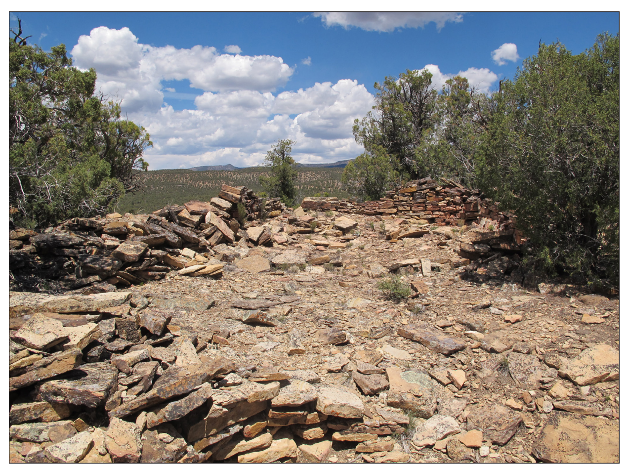
Figure 3. Tabeguache Pueblo, excavated by Hurst (1946).

are shown in figure 5. The majority are arrow points representing types that would not appear out of place at either a Fremont or a Pueblo II site (Rosegate or Pueblo II side-notched), though many closely resemble a unique type of arrow point recovered from Pueblo II sites in the Dolores area (Bradley 2000; Greubel et al. 2006:Figures 7-11). Ground stone assemblages from these sites are dominated by one-hand manos. Use-wear analyses of metates, however, suggest that most were used for grinding maize (Greubel et al. 2006:32), as was the single two-hand mano identified. Although not present in the materials analyzed by Alpine, a photograph of excavations at the Weimer IV site shows a grooved maul in situ. Grooved mauls are relatively common on Ancestral Puebloan sites but uncommon at sites north of the Northern San Juan region.