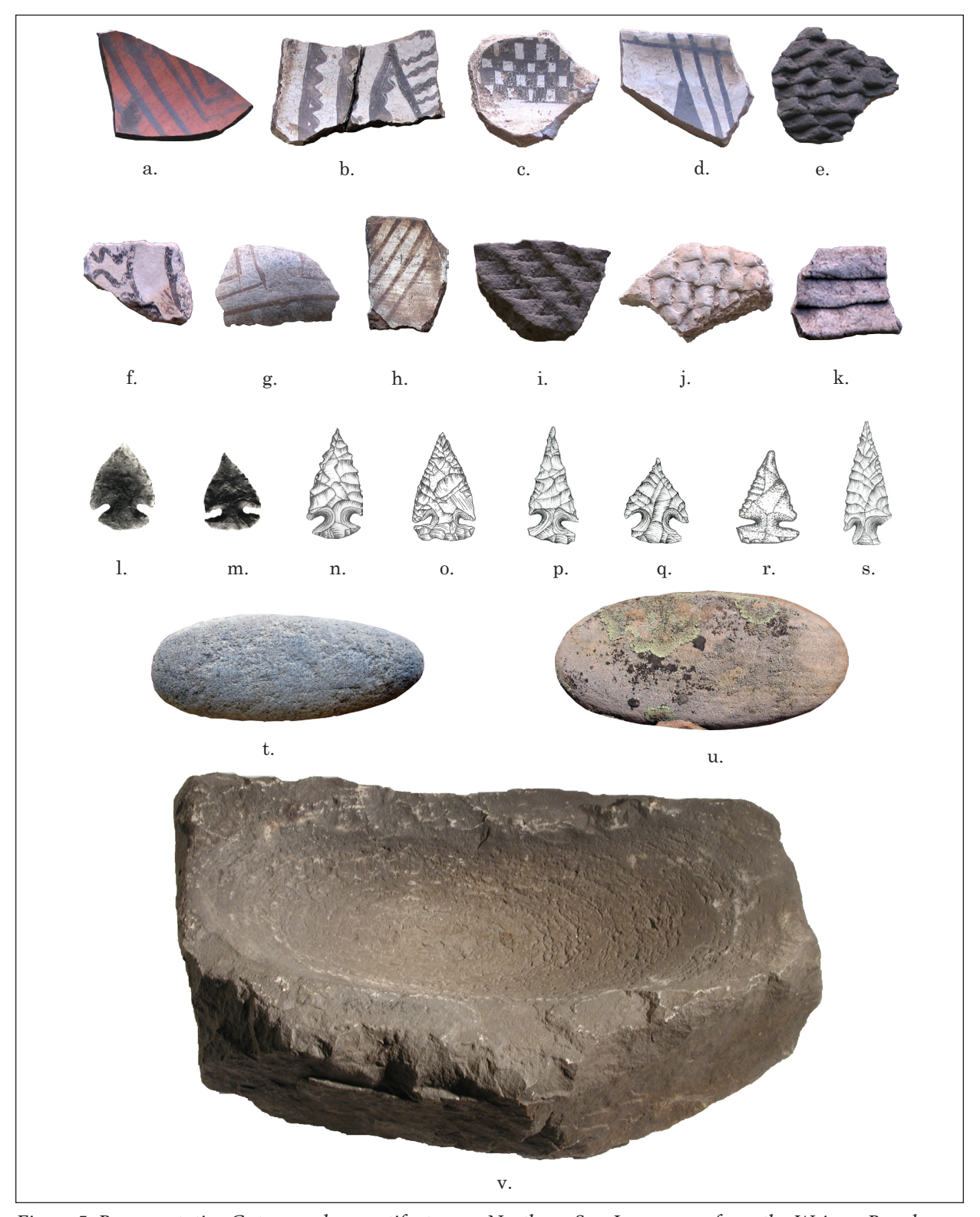
Figure 5. Representative Gateway phase artifacts. a-e, Northern San Juan wares from the Weimer Ranch sites; f-k, locally manufactured wares from the Weimer Ranch sites; l-m, arrow points from Paradox (5MN191); n-s, arrow points from the Weimer Ranch sites; t, two-hand mano from Paradox (5MN191); u, two-hand mano from the Weimer Ranch (Battleship, 5MN368); and v, metate from the Weimer Ranch (Cottonwood Pueblo, 5MN654). Artifacts are not to scale.