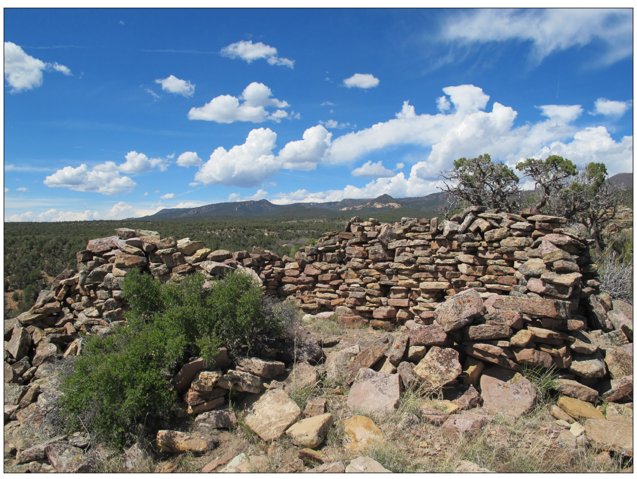
Figure 4. Site 5MN364, a single-room structure on a high promontory.

previously identified as Fremont; this remains an important research concern.