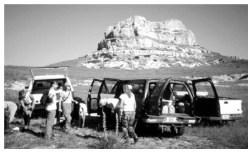
Archeological crew at Wind Springs Ranch, Sioux County, 1999.

and temporally, and span the Paleoindian period through protohistoric Native American occupation as well as including Euroamerican ranch features and historic wagon roads. The locality seems to have been most intensively occupied during the Middle and Late Archaic periods. Testing at several locations on the ranch has revealed intact cultural deposits on butte tops as well as within the stream valley.