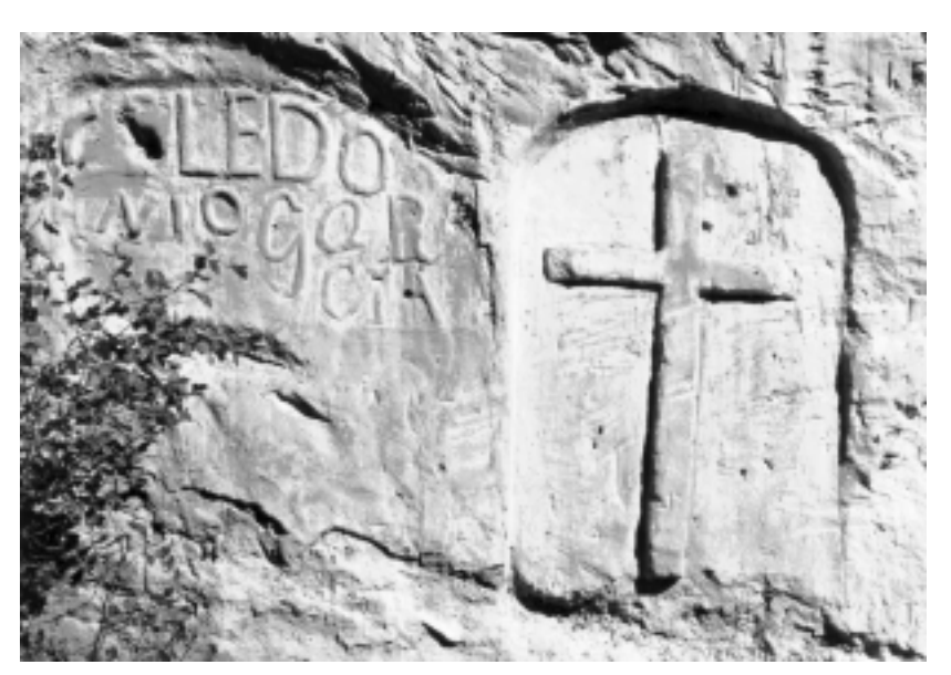
The Spanish Cross, Sheridan County, 1972.

increased greatly and reached its peak from 1876–78. Many of the trail ruts still exist in areas that have not been farmed or developed. Several stage stations existed along the trail. Many of these have been identified as archeological sites during times of the year when vegetation is sparse along the entire length of the trail.