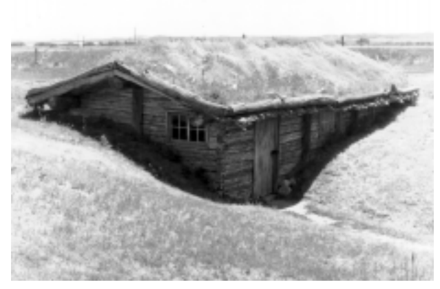
Reconstructed Bordeaux Trading Post, Dawes County, 1973.