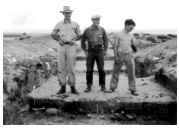
Archeologists on top of Barn Butte, Garden County, 1933.

and Garden Counties to Barn Butte, southeast of Oshkosh. Renaud identified more than forty sites including stream valley locations, rock shelters, and butte-top sites.