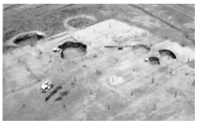
Trading post excavation, Deuel County, 1968.

The Sidney-Black Hills Trail was a 267-mile-long thoroughfare for bull wagons, mule trains, mail couriers, and stagecoaches during the Black Hills "gold rush" of the late 1870s through the early 1880s. The volume of traffic over the trail