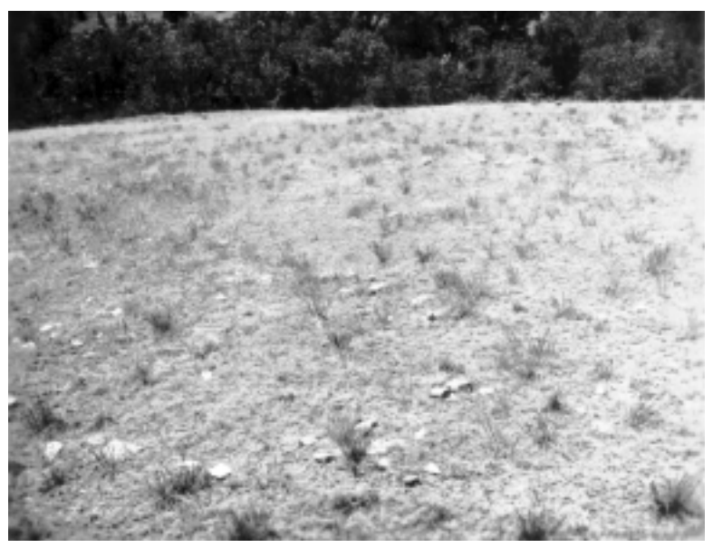
Tipi ring in Sioux County, 1966.

produced fairly quickly with little effort and is associated with light-duty butchering or plant processing. The majority of tools recovered are in the early stages of manufacture. Many may have been the product of stone core reduction. Raw material in this form is easier to transport than blocky cores and allows the carrier to manufacture tools later at locations distant from the quarry.