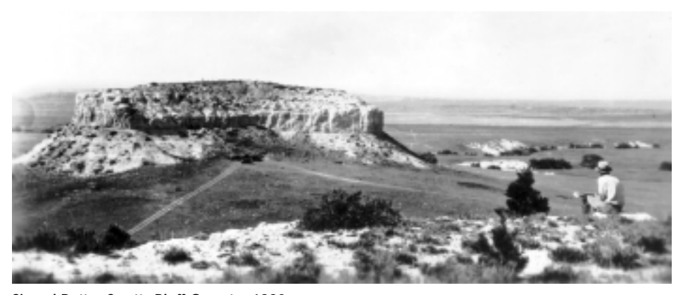
Signal Butte, Scotts Bluff County, 1930s.

The Plains Archaic or Archaic period (9,000–2,000 years ago) is characterized by nomadic, broad-spectrum hunting and gathering and is well represented in western Nebraska. Many private collections from the region include tapered spear points and stemmed or notched projectile points dating to this period. Warmer and drier climatic conditions on the Plains during this period affected plant communities and forage availability for large grazing mammals