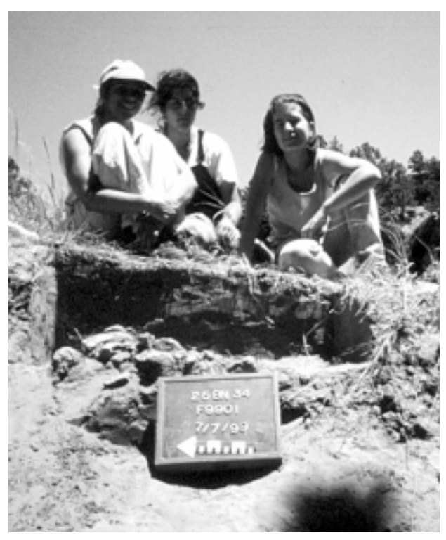
Excavated Native American fireplace, Banner County, 1999.

The Nebraska State Historical Society recognizes the need to balance preservation and the public's desire to participate in research. This publication series is directed to this need. The Society sponsors volunteer excavations for the general public.