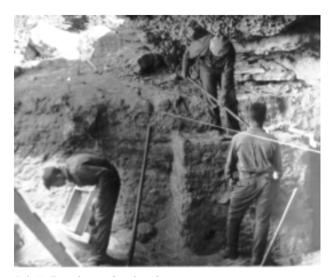
Ash Hollow Cave, Garden County, 1939.

During the late prehistoric period (A.D. 1000–1700) Central Plains tradition people in eastern and central Nebraska were actively engaged in hunting and gathering of wild plants and animals, as well as horticulture. The presence of Central Plains tradition people in the Panhandle region is evident in the form of small, sidenotched, or triangular projectile points and ceramic sherds recovered from a variety of locations including butte tops, rock shelters, and stream valley terraces. However, very few sites of this age have been systematically investigated in the Panhandle, and only one semi-permanent habitation site of this age has been documented in the region.